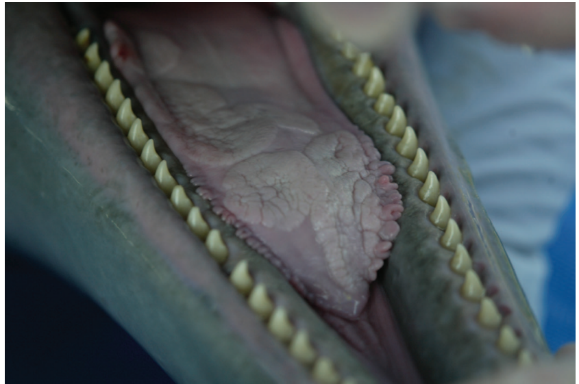
A newly documented oral sessile papilloma in a free-ranging Atlantic bottlenose dolphin discovered as part of a dolphin health assessment program in Florida.