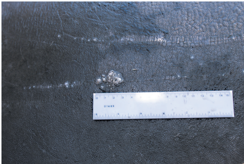
Multiple cutaneous sessile maculopapular papillomas on the dorsum of a manatee associated with a papillomavirus (TmPV-1), whose genome was recently sequenced. The linear distribution of the tumors suggests traumatic self-inoculation.

such as immunohistochemical staining to verify the presence, abundance, and distribution of brevetoxins in tissues. Brevetoxicosis in manatees may occur after chronic inhalation and in-