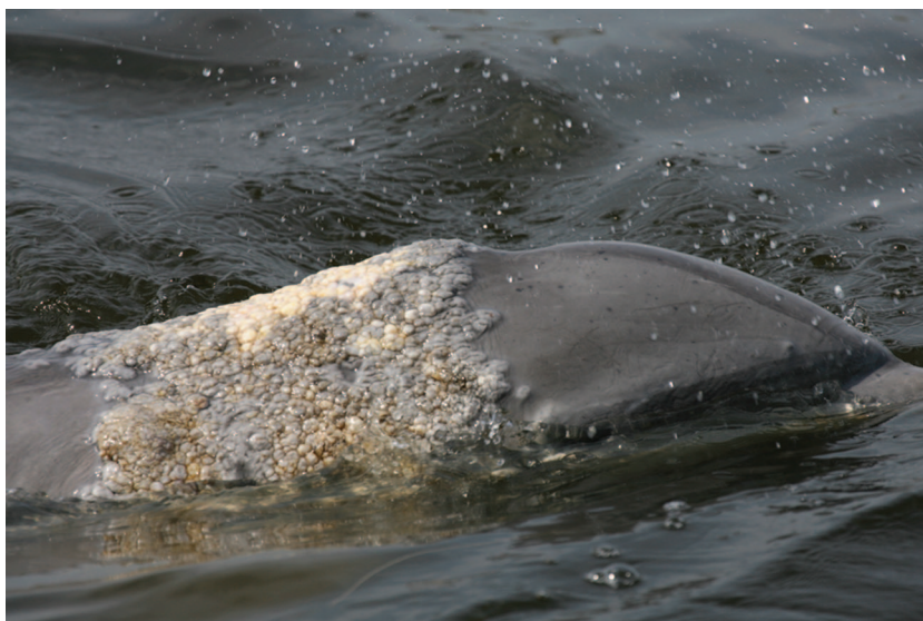
Cutaneous lobomycosis in a free-ranging Atlantic bottlenose dolphin from Florida.

gestion, and the subsequent release of inflammatory mediators may lead to fatal toxic shock. Only manatees among marine mammals and humans appear to be susceptible to brevetoxin through inhalation. Indeed, emergency room diagnoses of this pulmonary condition increase during Florida red tides.